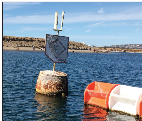
End anchor that will need to be removed and replaced